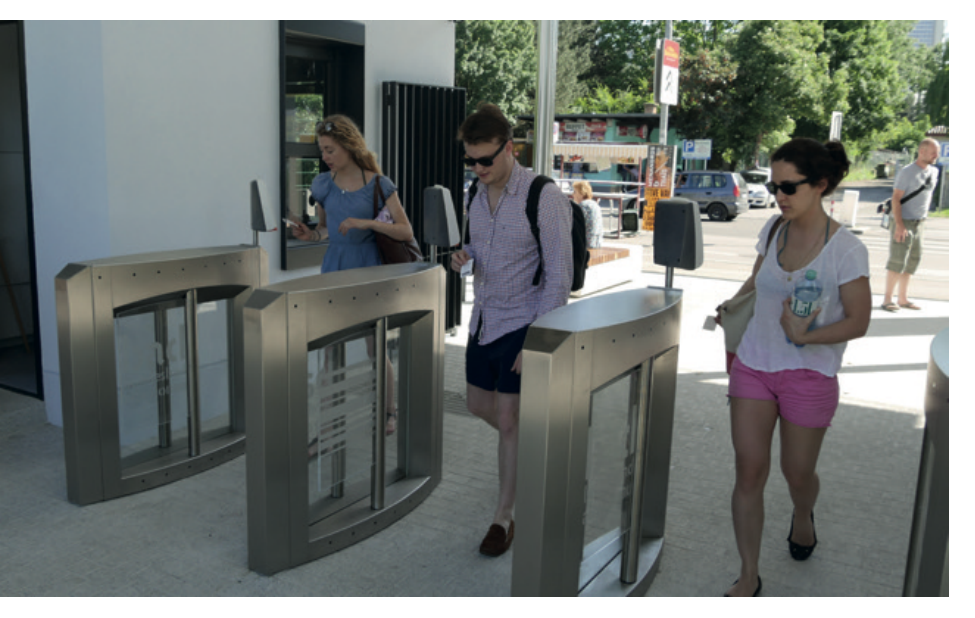
The Selection DF guarantees a barrier-free access at the newly renovated Bundesbad Alte Donau.

Additional products for pools and recreation