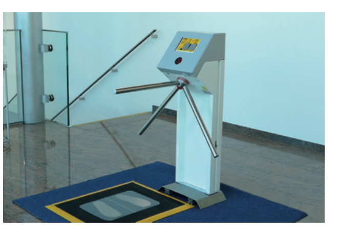
The innovative and unique combination of Personnel Grounding Test and turnstile represents the new generation of ESD-access.

Gotschlich offers a reliable and unique solution: the well-proven Compact turnstile with integrated Personnel Grounding Test. It checks if a person is electrostatically charged. The turnstile will grant access for the employee only after a proper discharge has been effected.